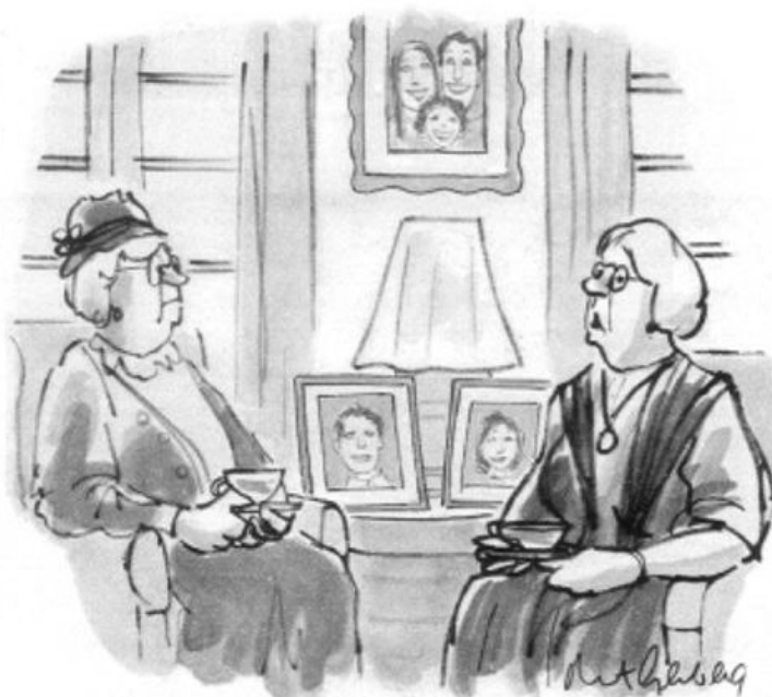
"They never phone, they never visit, they never text message..."